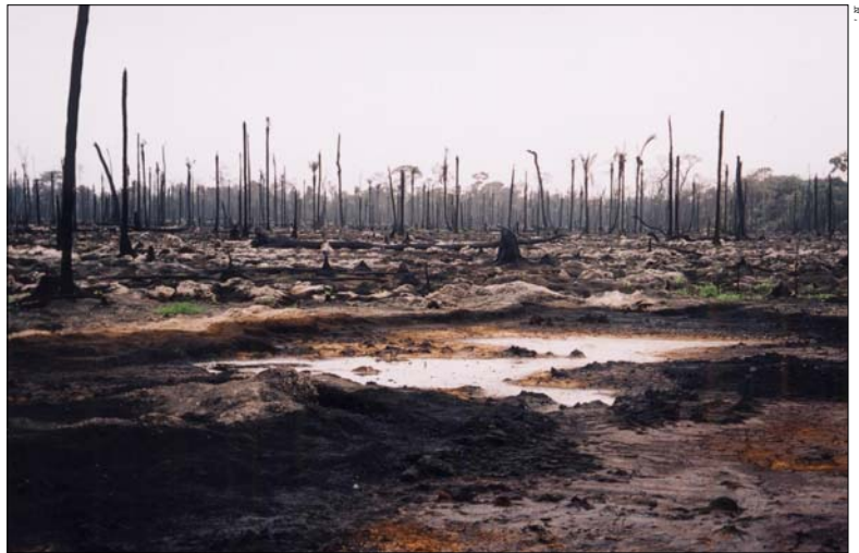
An oil spill devastates farmland in Rivers State, Nigeria. The spill occurred in December 2003. However, when AI visited the site in March 2004, the damage remained extensive and there were no signs that a clean-up had been initiated.