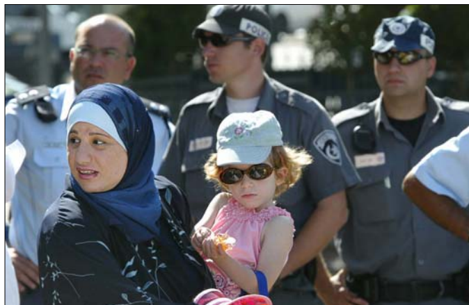
A woman and her daughter join a demonstration in July against the Citizenship and Entry into Israel Law

The Israeli government has claimed that it is acting in the interests of national security, arguing that fewer Palestinians in the country would lessen the threat of violence and attacks carried out by them. However, these claims collapse in the face of comments made by Israeli ministers and officials describing the Palestinians – who