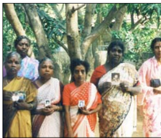
Women whose relatives have 'disappeared' in Sri Lanka show the photos of their missing loved ones

Since 1994 the government has taken several initiatives to try to address the problem of "disappearances" including through the creation of a National Human Rights Commission and the above mentioned commissions of inquiry. It also created special units in the Attorney General's department and the police department to investigate and prosecute perpetrators of "disappearances". In 2001 it set up the Central Police Registry of arrests and a telephone hotline for relatives to locate detainees. Although these are positive steps, further measures need to be taken by the government to bring those responsible for past "disappearances" to justice and prevent such grave violations of human rights from happening again.